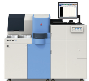
AIA-2000 200 Tests Per Hour

AIA-900 is also available as 9 tray and 19 tray sorter models.