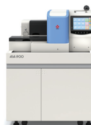
AIA-900 90 Tests Per Hour

AIA-900 is also available as 9 tray and 19 tray sorter models.