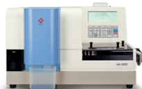
AIA-600 II 60 Tests Per Hour