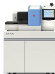
AIA-900 90 Tests Per Hour

AIA-900 is also available as 9 tray and 19 tray sorter models.